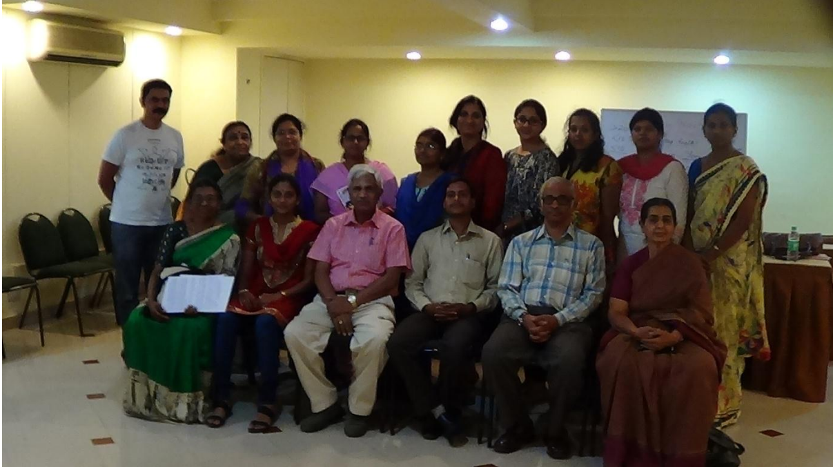
Participants with faculty of One day Basic Acupressure Course held on 17 th April 2016 in Hotel Chalukya

Tel : (080) 2313 2103 e-Mail : acuacademybgl@gmail.com Website : www.acupressureclub.org